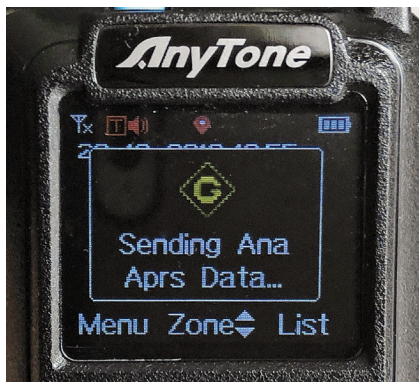
Figure 8 — The AnyTone AT-D878UV sending an APRS beacon.

repeaters in your area are configured the same way — the talk group (TG) you want to roam on must be available on all the repeaters. Luckily for me, that's the case in our region.