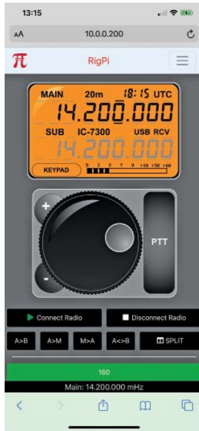
Figure 5 — The RigPi web interface running on my iPhone XS MAX.

Here's an example of support I got from the group. When you select your transceiver in the SETTINGS tab of the RigPi interface, most macros will work, but many radio functions are not included in the default