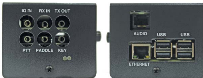
Figure 3 — The MFJ-1234 inputs and outputs.

Using the mouse and keyboard, I configured my Wi-Fi network (it's best to use a wired ethernet cable). After you are connected to your home network, you can do all the settings remotely or continue directly on the device.