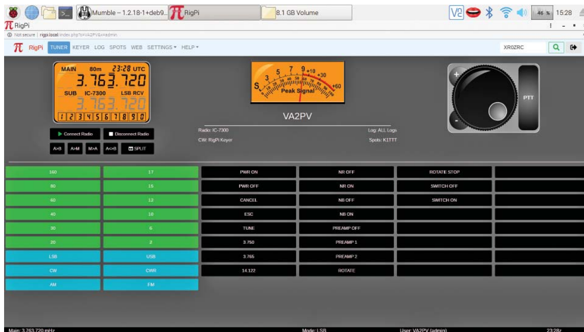
Figure 4 — The MFJ-1234 RigPi interface on the Raspberry Pi with customized macros for my transceiver and operating preferences.

With the MFJ-1234 connected to my home network, I was able to connect to the RigPi server by simply typing the RigPi IP address in my cell phone's internet browser. I entered the default user and password (from the MFJ-1234 manual) and I was in. Then I selected my radio in the SETTINGS tab and was able to power it on.