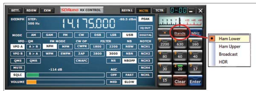
Figure 3 — Preselectors are available for various frequency ranges.

The RSPdx with SDRuno software offers a good performing, wideband, multimode receiver at an attractive price. I like the fact that this radio can be used for many applications. For someone newly interested in shortwave listening and ham radio, the SDRplay receivers offer a good starting point. The RSPdx allows someone to check out many aspects of the hobby without breaking the bank. If they do get licensed and move up to a transceiver, the RSPdx will still be useful for general listening/scanning, as a pan-adaptor, or as a spectrum analyzer.